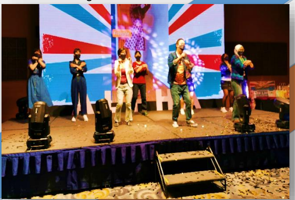
Group performance - "Ayam Giler Friend" from Main Office staffs with their dancing performance in 70's.