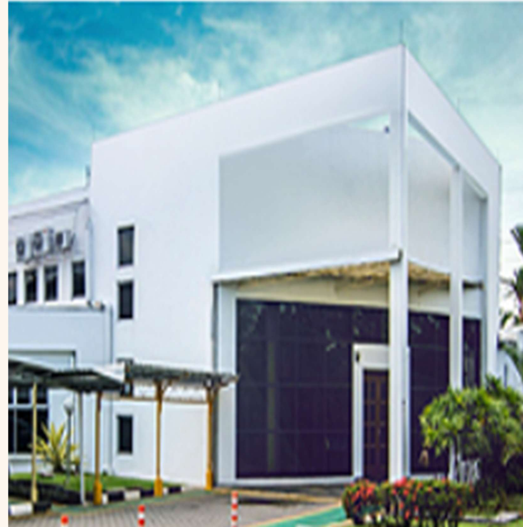
Alpha Industries Sdn Bhd

Now in its sixth edition, Tautan Kasih 6.0 continues to strengthen the bonds between the company, its people, and the wider community — embodying Alpha Industries’ commitment to giving back with heart and purpose.